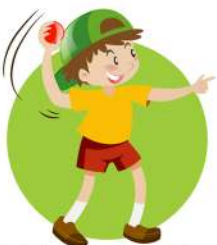
Point non-throwing arm at target