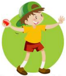
Ready: Stand side on like a surfer