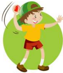
Aim: Make a muscle arm