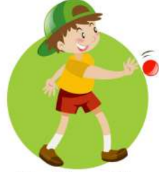
Fire: Step with non-throwing side foot and throw